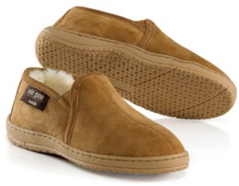
Jason Slipper UB-808

Elastic gusset makes it easy to slip on and the rubber outsole provides much flexibility.