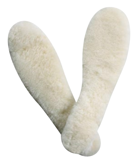
Sheepskin Innersole UB-INS