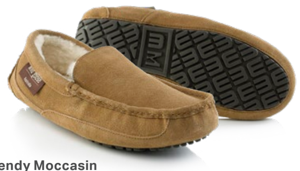
Trendy Moccasin UB-931

It offers a modern look and warmth. Featuring moulded rubber sole \, for better grip and flexibility.